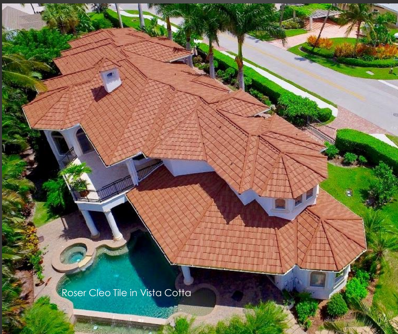
Roser Cleo Tile in Vista Cotta

Superior performance from a lightweight steel roofing system that adds dynamic curb appeal to any building or home along with outstanding fire, wind and hail resistance.