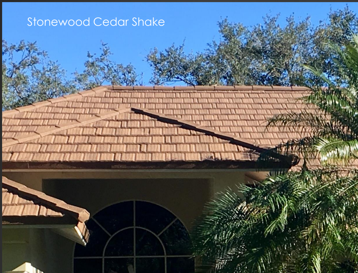
Stonewood Cedar Shake