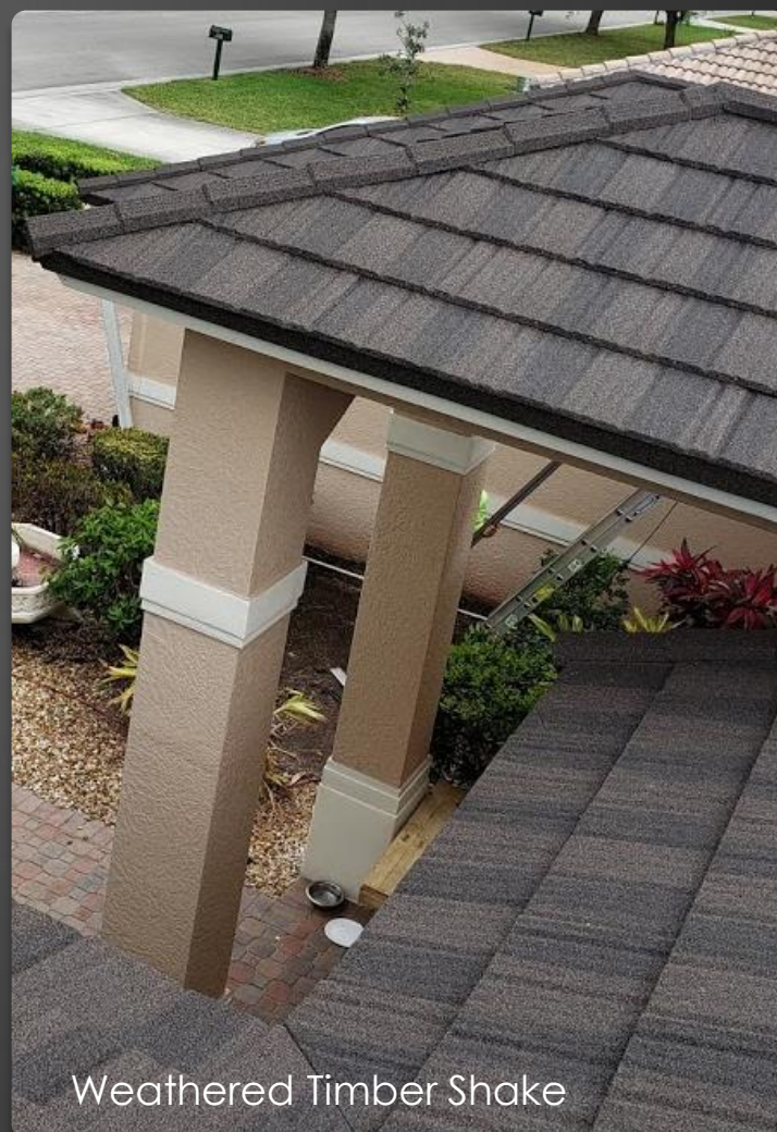
Weathered Timber Shake

Available in blended, aged wood hues for natural appearance and irregular texture with added shadow lines for depth and a heavyweight look. Stonewood Shake installs in either direction and our horizontal fastening system increases wind uplift resistance.